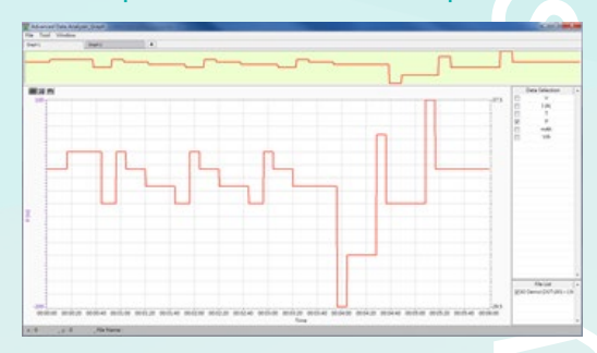
▲ DST Cycle Test Figure Obtained Using MCL2 Series

2 The DST (Dynamic Stress Test): a repetitive 360-second test profile