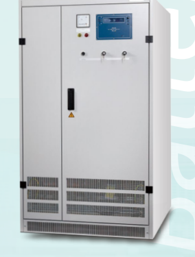
▲ PBT 1000 Series

Quick current response time (rising/ falling time) is necessary to meet corresponding current output requirements in drive simulation tests.